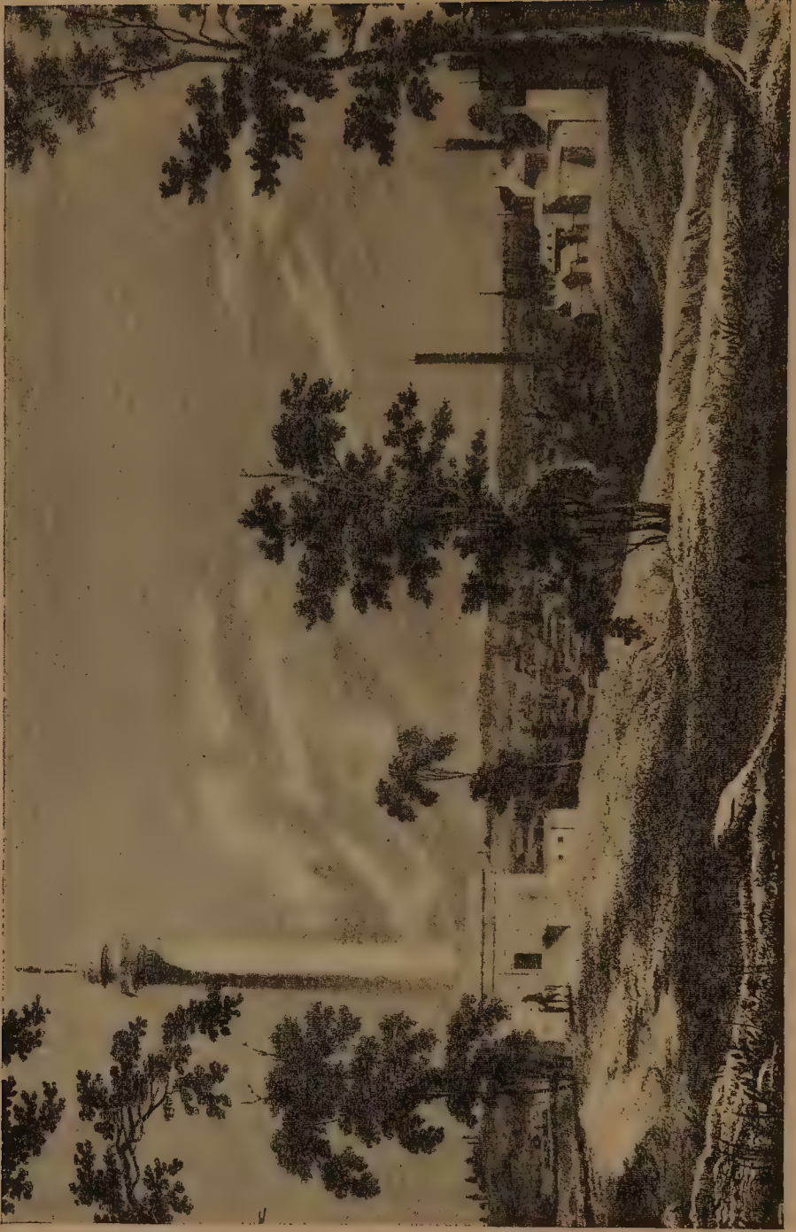
WASHINGTON MONUMENT, BALTIMORE, IN EDGAR AND HENRY POE'S DAY